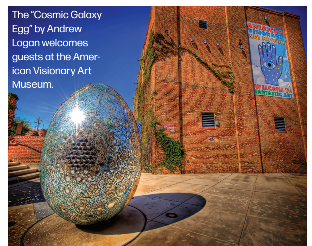
The “Cosmic Galaxy Egg” by Andrew Logan welcomes guests at the American Visionary Art Museum.

📍 10 Art Museum Drive, Baltimore, 21218; 🌐 artbma.org