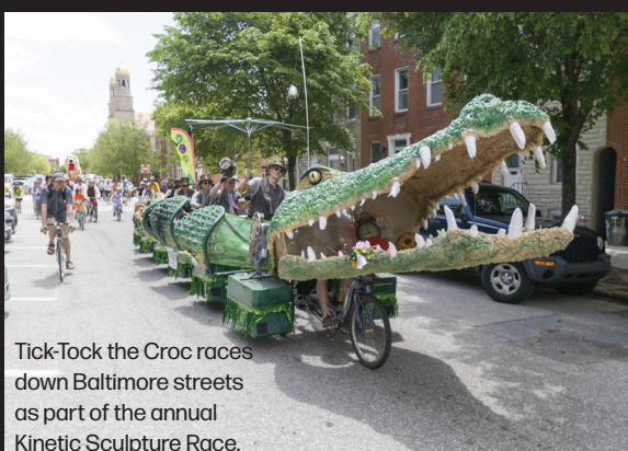
Tick-Tock the Croc races down Baltimore streets as part of the annual Kinetic Sculpture Race.

1910 North Charles Street, Second Floor, Baltimore, 21218; thecrownbaltimore.tumblr.com